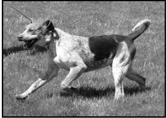
Un-entered dog, NM-MVH Limerick out of NM-MVH Dancer by Blue Ridge Lapworth.